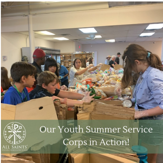
Our Youth Summer Service Corps in Action!

https://www.allsaintsoncentral.org/summer-of-service