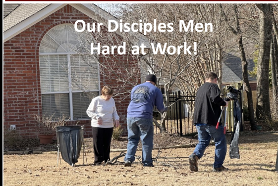
Our Disciples Men Hard at Work!