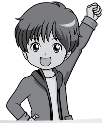
Master Writer's Version

A single bead of perspiration rolled down from my left temple and I furrowed my brows at the harsh hubris spewing from Janelle's great, big mouth. "Boy, those are some thick lips. Argh! I can't stand her high, grating voice. She sounds like a crow," I muttered to myself under my breath.