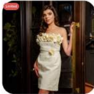
Dress with flowers $ 700