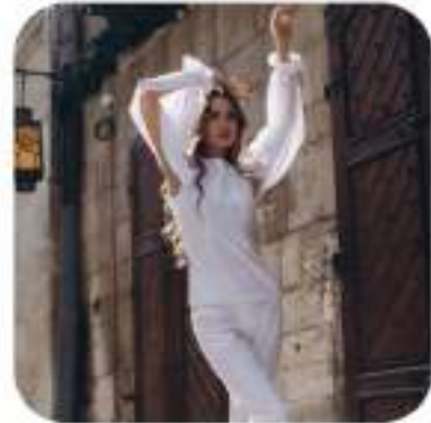
Dress-suit white $ 445

calculations are indicated without taxes of your region and without VAT