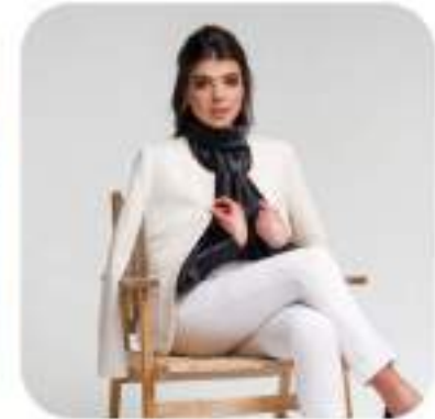
Milk jacket $ 250