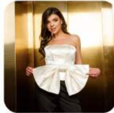
Milk corset with a bow $ 350