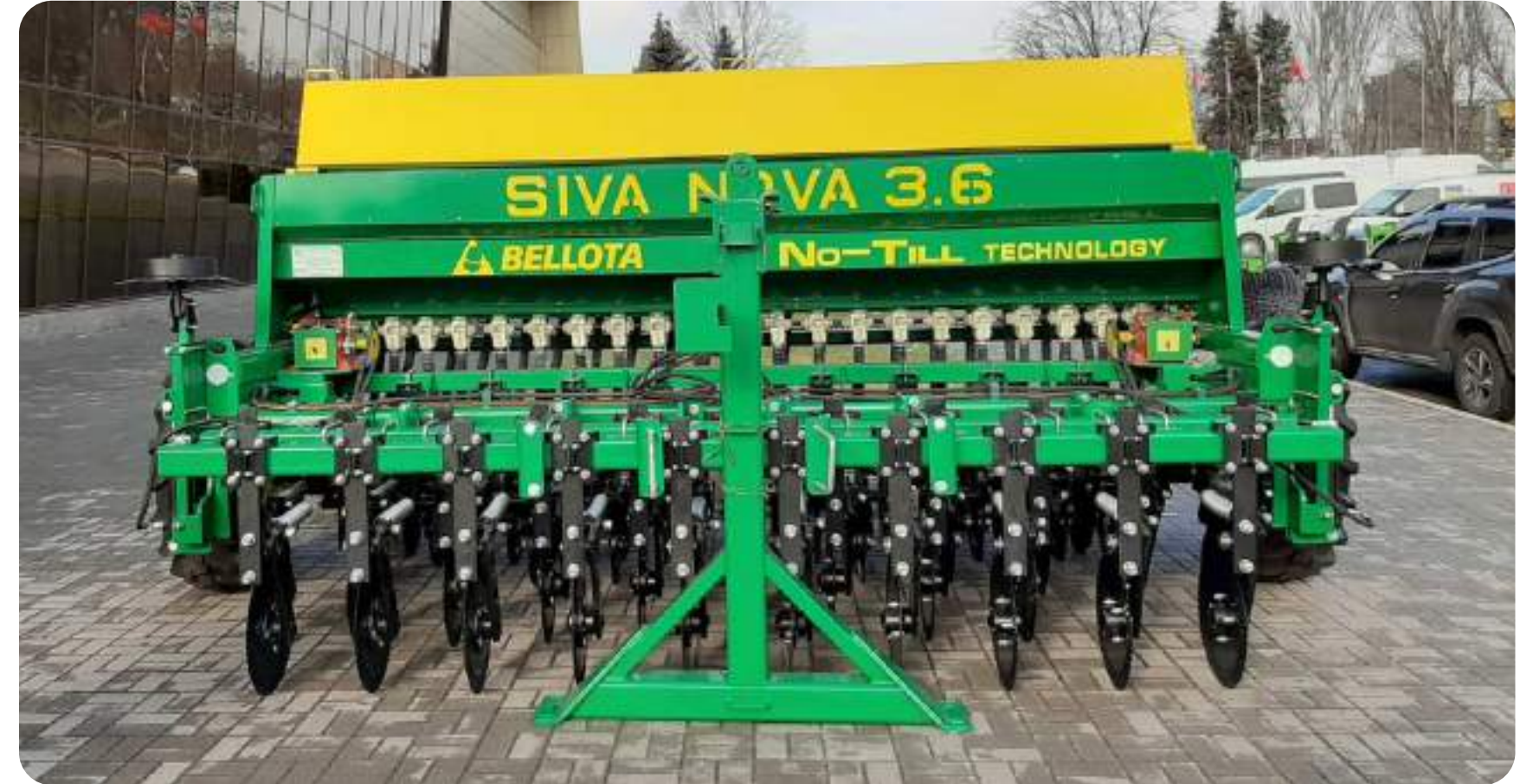
Siva Nova No-Till

Planters of three width sizes are available: 3.6m, 3m, 2.1m