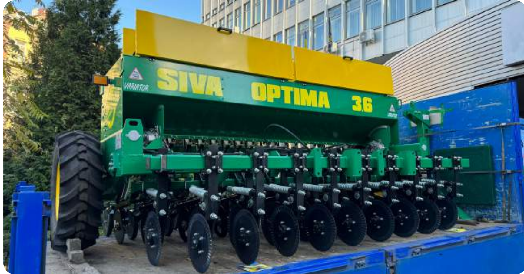
Siva Optima No-Till

Planters of three width sizes are available: 3.6m, 3m, 2.1m