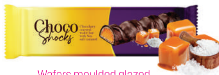
Wafers moulded glazed «Choco-Shocks» with sea salt caramel, 20 g.

Moulded wafer bar with chocolate filling and hazelnuts covered with dark compound chocolate Net weight – 20 g Shelf-life: 12 month HS Code: 1905321100