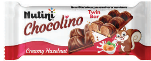
United Kingdom of Great Britain — «Chocolino» with hazelnut