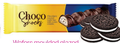
Wafers moulded glazed «Choco-Shocks» with cookies crumbs, 20 g.

Moulded wafer bar with milky filling and sea salt caramel covered with dark compound chocolate Net weight – 20 g Shelf-life: 12 month HS Code: 1905321100