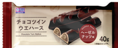
Japan — チョコツイン ウエハース