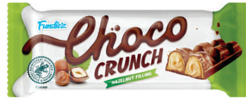
Nederlands — «Choco-crunch» with hazelnut