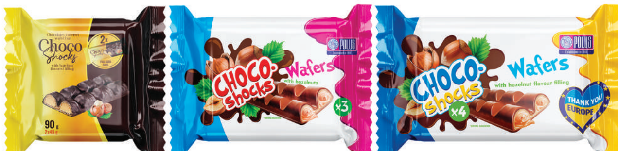
Wafers moulded glazed «Choco-Shocks» with hazelnuts, 2*45g

Moulded wafer bar with chocolate filling and hazelnuts covered with dark compound chocolate Net weight – 90 g Shelf-life: 12 month HS Code: 1905321100