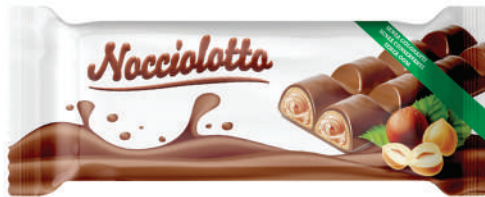
Italy — «Nocciolotto» with hazelnut