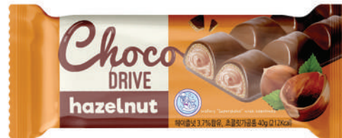
Korea — «Choco-drive» with hazelnut