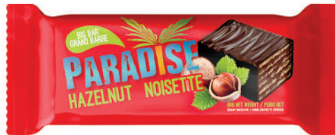
Canada — «Paradise» with hazelnut