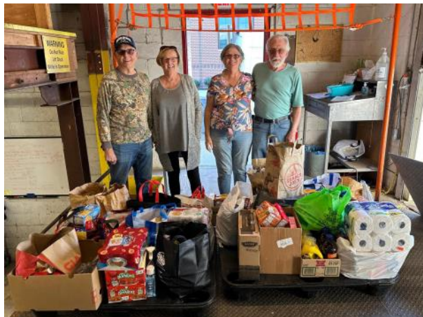
St. Peter's Pikeland United Church of Christ 501 lbs Donated